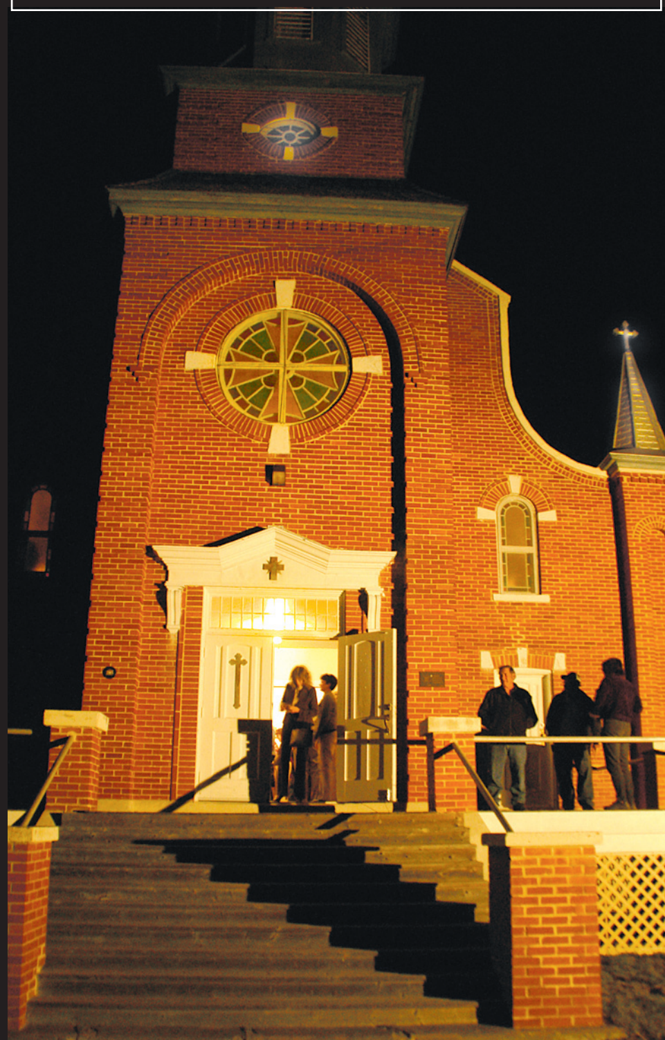
Intermission at St. Norbert's restored church means a breath of fresh air for some as a Juno award winner visits. The largest Neo-Gothic church in rural Alberta was built in 1922.