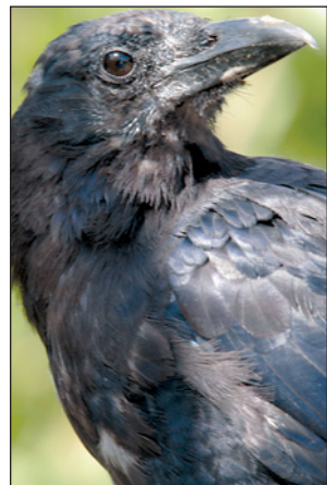
Will the new decorations also get rid of crows that wake some up early in town?

The Provost and District Chamber of Commerce is encouraging the event this fall with a bit of prize money. But of course it's not really just about that. It's about growing civic pride that will enhance downtown and other areas of the community.