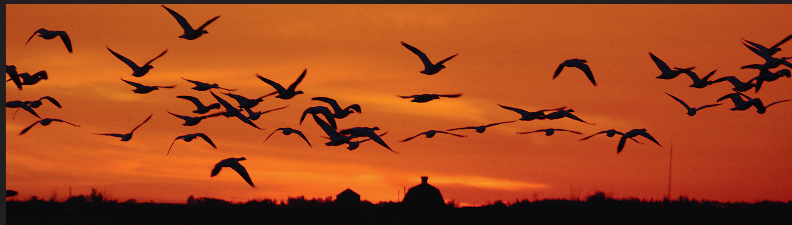
Canadian geese get ready to wing their way south after feasting on the remnants of a farmer's crop.