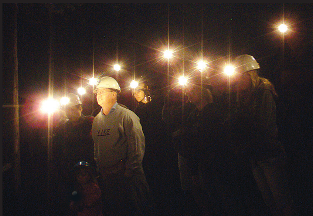
Local visitors hit the road and peer deep into an empty coal mine—before all the lights are turned off for a minute.