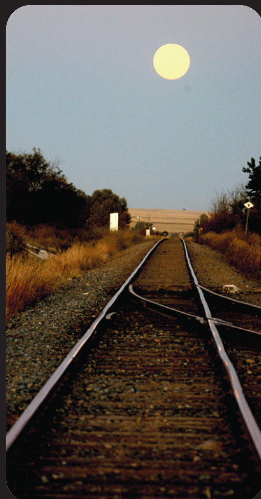
The moon quickly climbs up the sky before the sun can completely set.