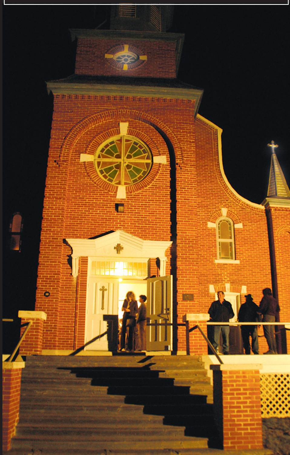
Intermission at St. Norbert's restored church means a breath of fresh air for some as a Juno award winner visits. The largest Neo-Gothic church in rural Alberta was built in 1922.