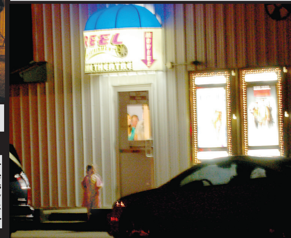
A youngster stands by the theatre door as adults get ready to come back outside.