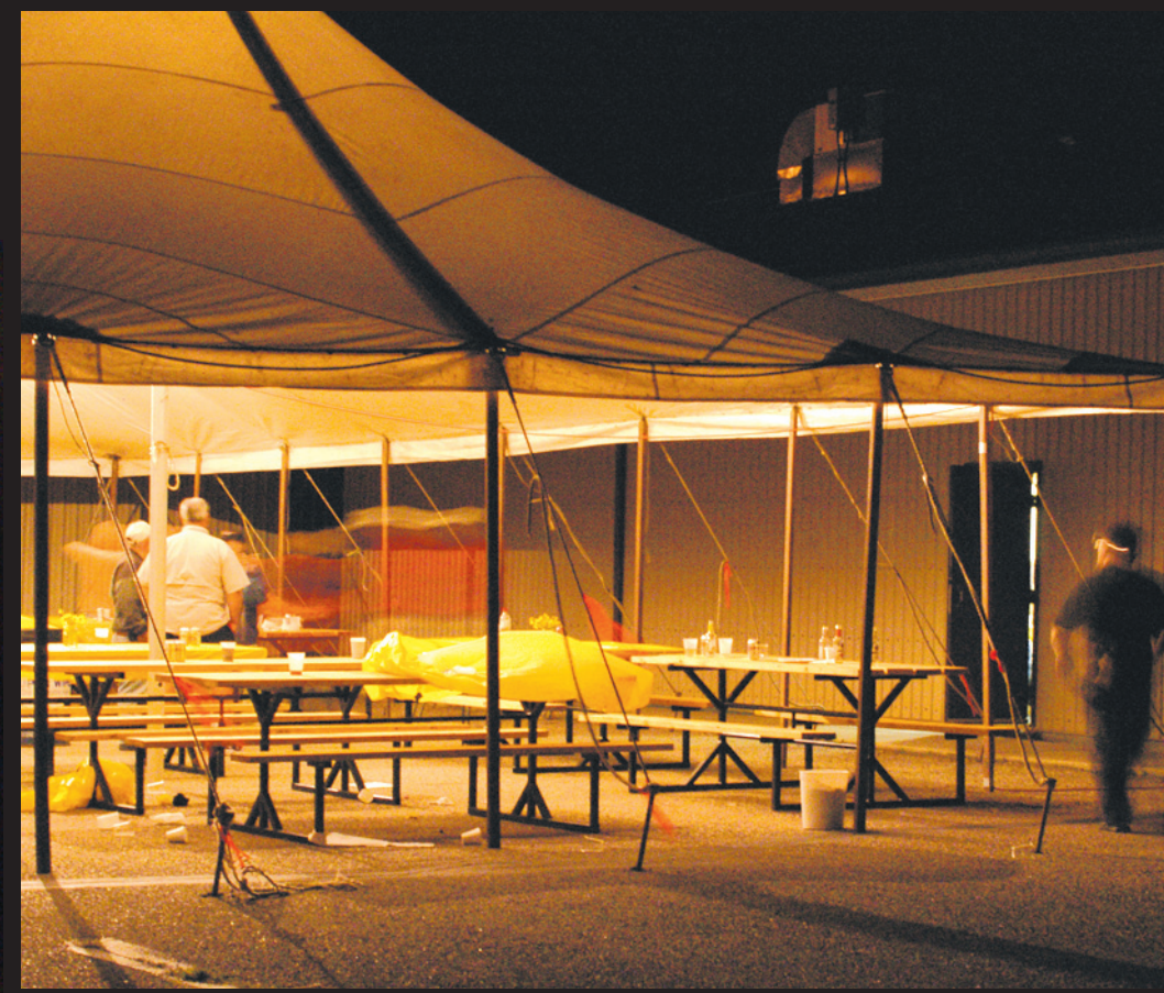
Hamlet of Cadogan guests finish supper at 100th anniversary celebrations and move into the hall for live entertainment.