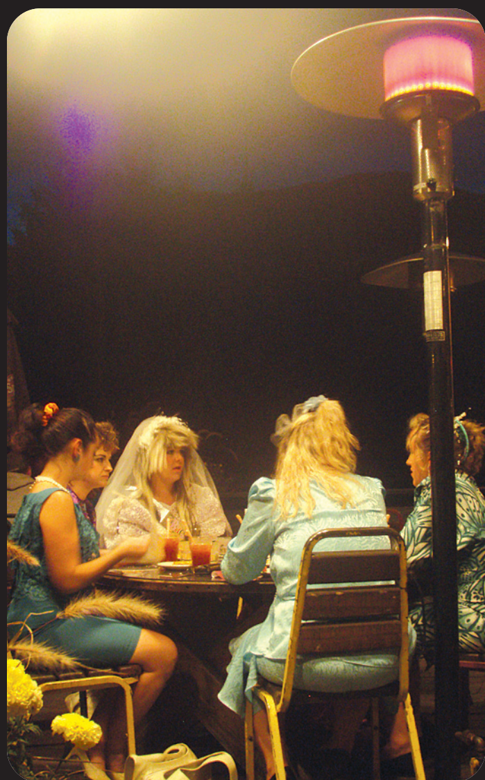
Several women celebrate an upcoming wedding.