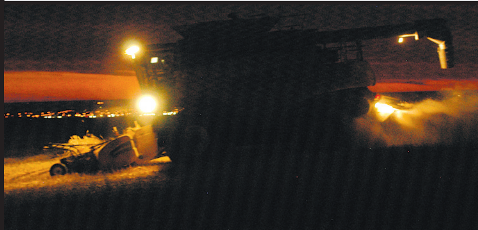
One of three combines in a field gobbles up the crop as the lights from Provost can be seen a few miles away in the background.